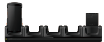
5-slot Share Cradle